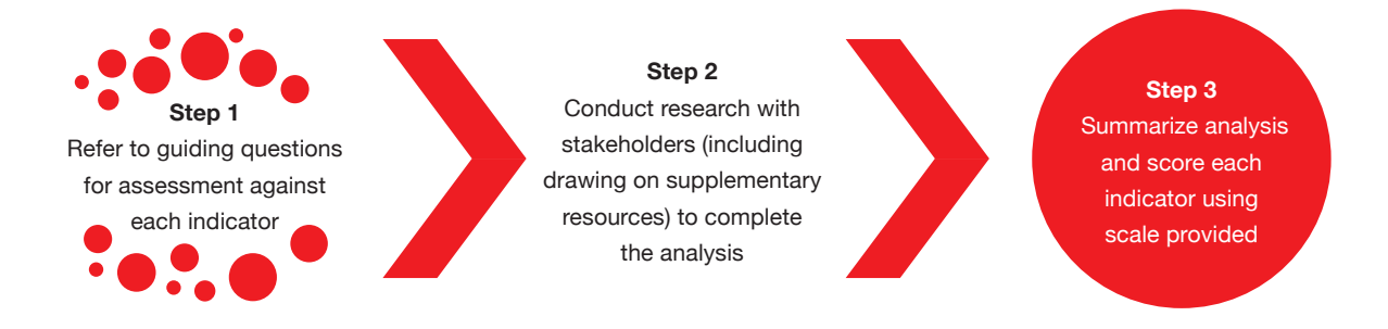
Figure 1: Key steps for using the toolkit

The Guiding questions (see Step 1, Figure 1) are intended to prompt critical reflection rather than to serve as sub-indicators. Tools 1 and 2 also list other relevant resources and conceptual background information and to provide guidance to applying each indicator. These supplementary reference materials may be updated over time to draw from the various experiences of public sectors and CSOs to hold stakeholders accountable using VGGT principles (See Step 2, Figure 1). The scorecard (see Step 3, Figure 1) helps document the analysis and enable an approximate scoring.