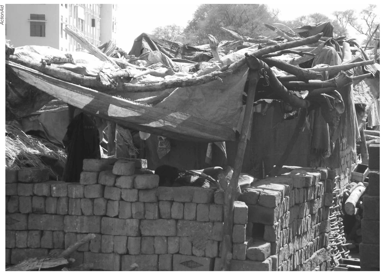
Worker housing, brick kiln, Hyderabad

This is also a story of organisational change and awakening – being in the company of people who are perpetually seeking out the next step, perpetually learning and perpetually in movement. Because it is only through movement that ActionAid can continue to be relevant to people's lives.