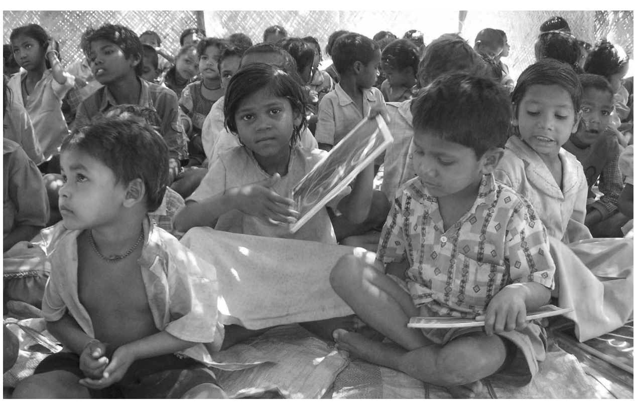
Shed School, Hyderabad

Back in Orissa, continuing dialogue with the District Collector resulted in Residential Care Centres being set up to keep children back in school while their parents worked in Hyderabad. ActionAid and CADMB, in collaboration with the state government, aimed to create residential care centres for an initial 58 migration-intensive villages from seven Gram Panchayats in five blocks. Nearly 900 children would directly benefit. At the time of planning, rights language and planning was explicit: the aims were to ensure that migrant children access their right to education and health and to push the government further to ensure that the children enjoy a secure, happy and carefree childhood - which is the spirit if not the letter of international child rights law. It was also envisaged that the school environment should be used in health promotion - in this case by ensuring the children get access to the government Midday Meal Scheme. ActionAid also planned to continue work with CADMB for advocacy and lobbying to increase resources for education. Finally, it was planned that parents, children, and the broader