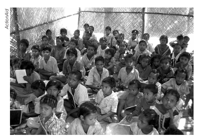
Shed School, Hyderabad

Alternative schooling for Orissan children in Andhra Pradesh faced a number of challenges any one of which could have run initiatives into the bureaucratic sand for months. The children spoke only Oriya, the language of Orissa. Even if schooling was provided in Andhra Pradesh, would they have to restart at the point where they broke off in Orissa or could continuity be arranged? And who would pay?