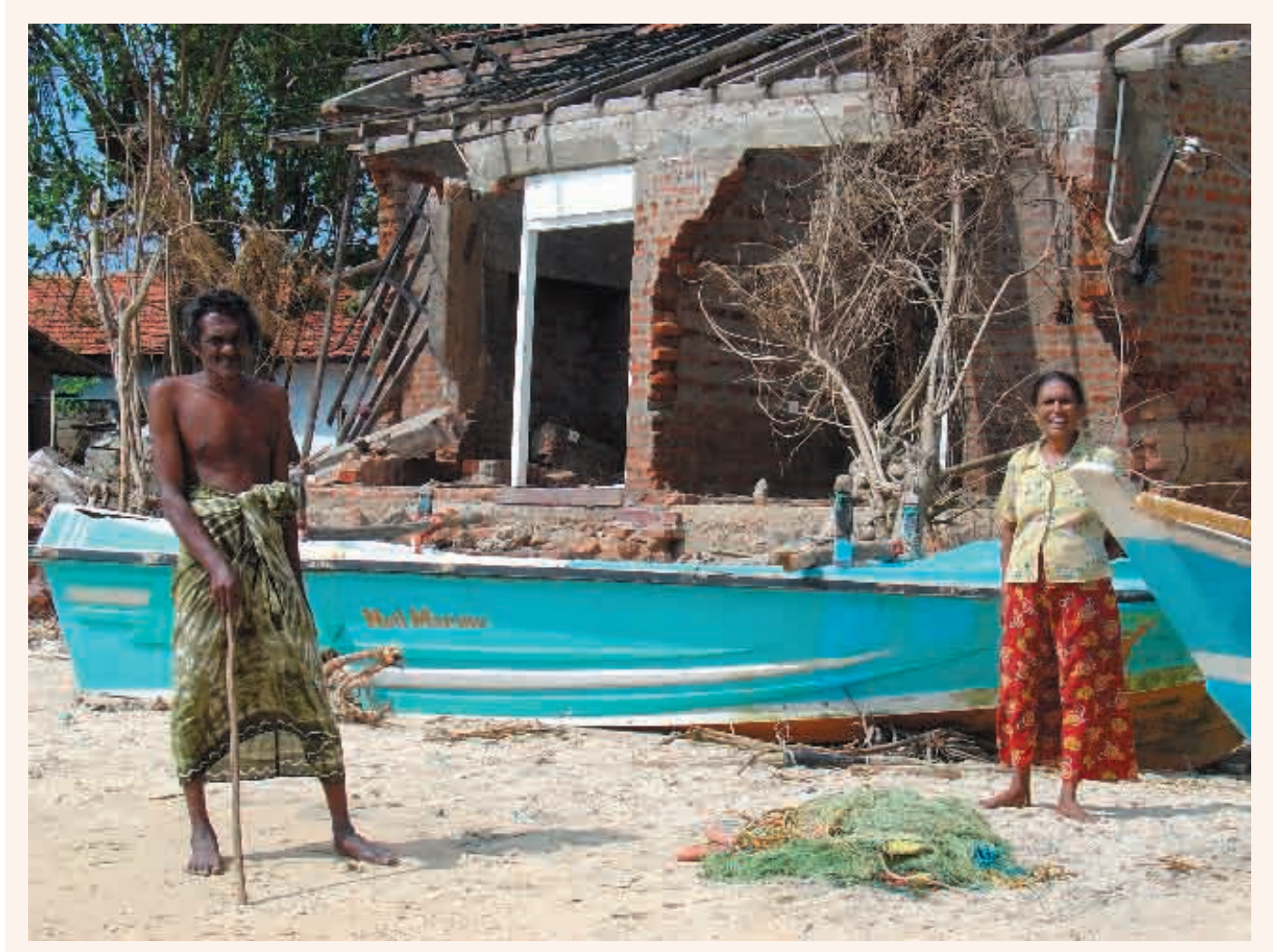
TSUNAMI-DESTROYED HOUSE IN SRI LANKA