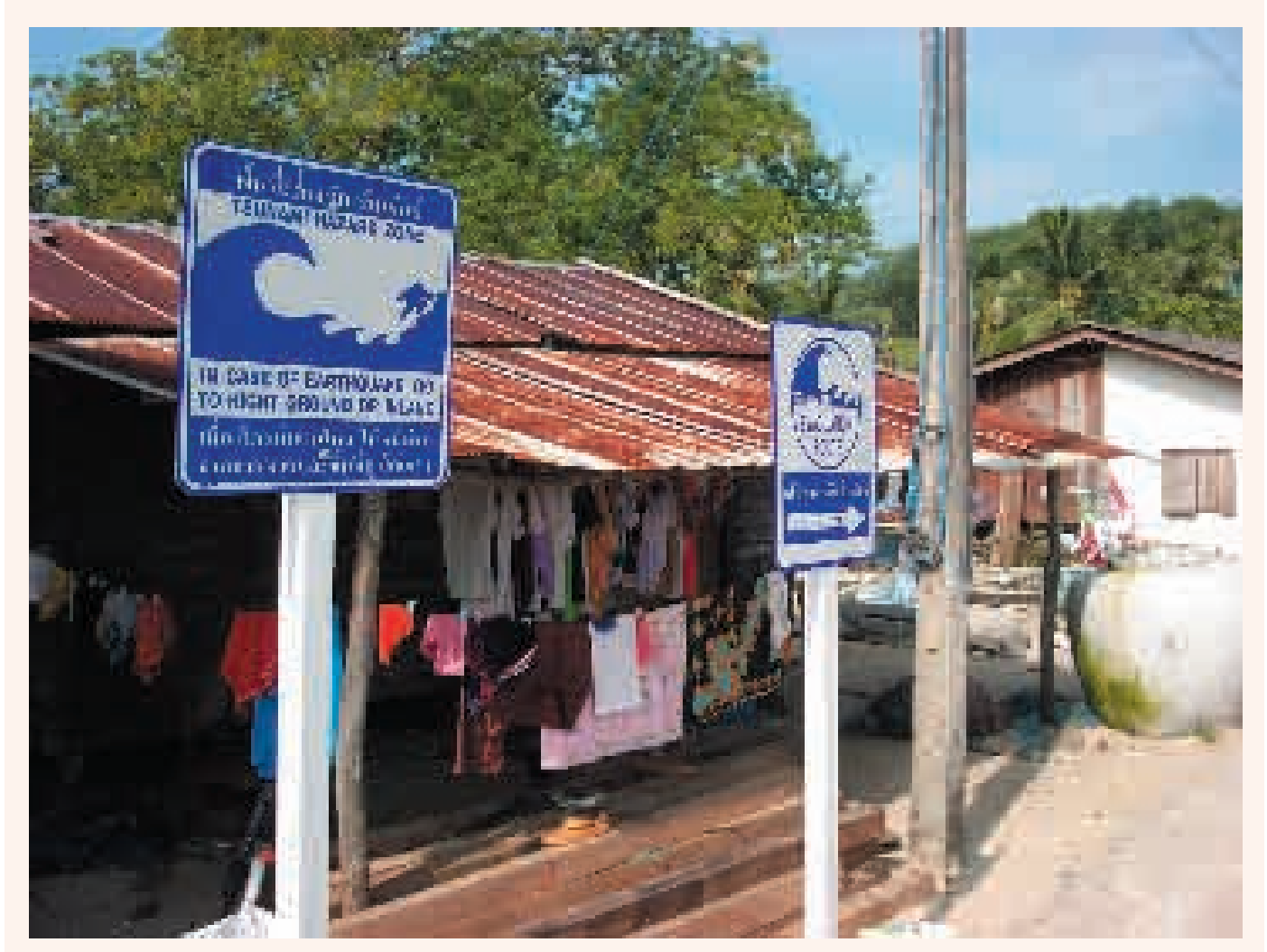
EVACUATION ROUTE IN THAILAND