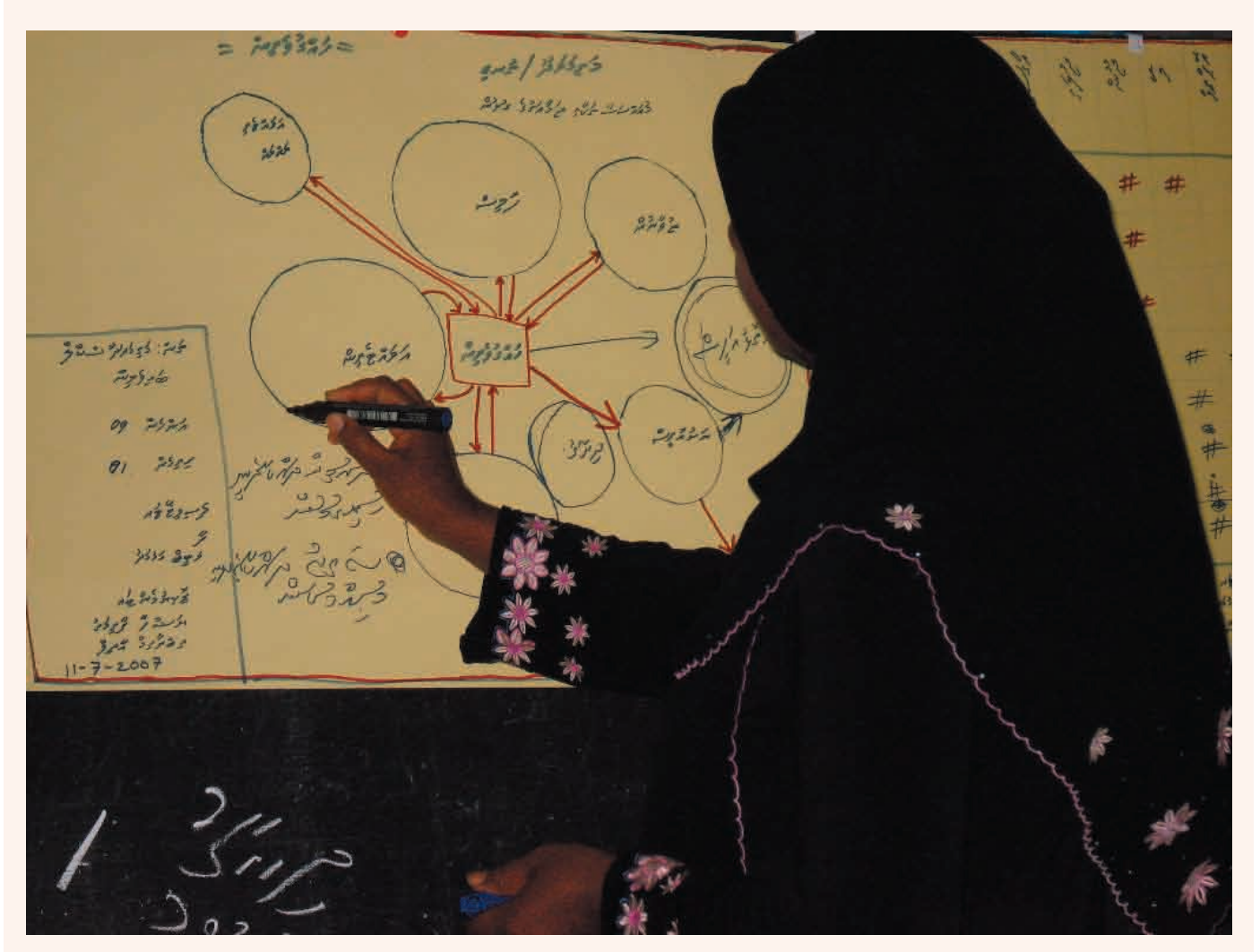
VENN DIAGRAM, THE MALDIVES