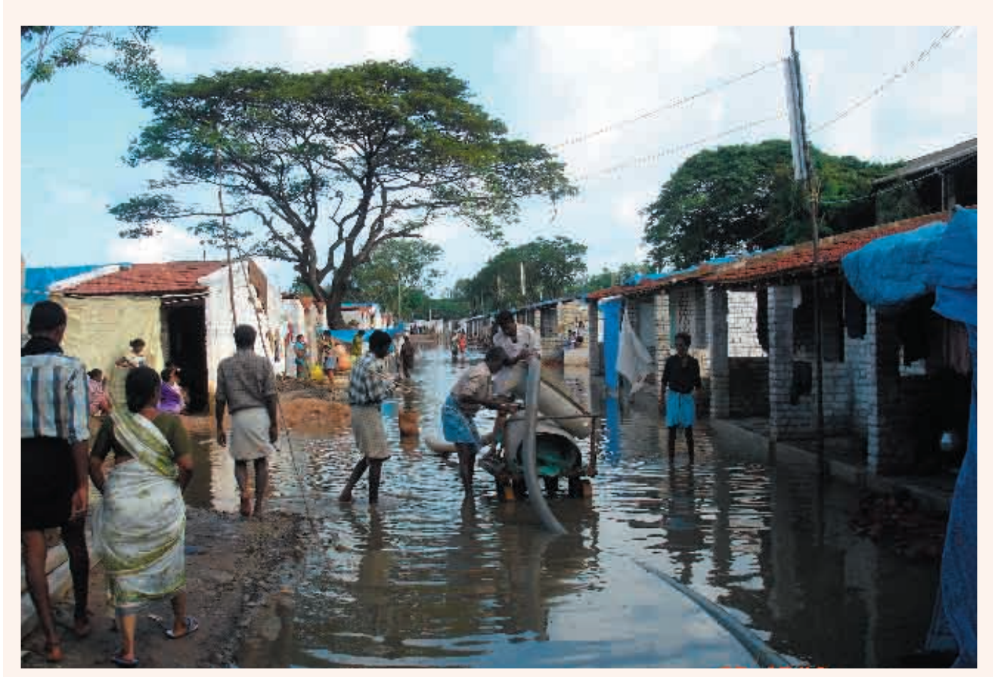
FLOODED TRANSITIONAL SHELTERS IN ERNAVORE, INDIA