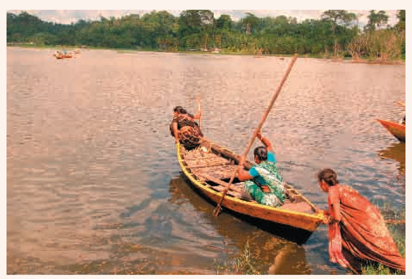
WOMEN LEARN NEW LIFE SAVING SKILLS IN INDIA