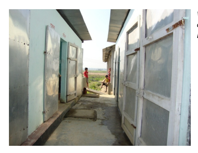
Women's and men's bathroom facing each other with the common entrance, Nalbari District, India.

Along with Women's Rights, the core theme of Education is committed to improving access for girls. However, during the DRRS programme, enrolment amongst girls appears not to have been a priority area for consideration. Again as noted in the India evaluation: