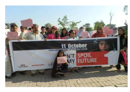
Figure 1 and 2: Girls Dolls Demonstration, Islamabad, Pakistan