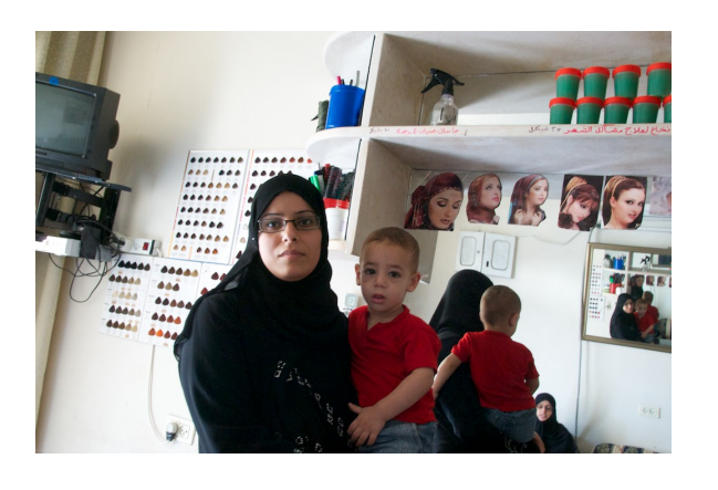
The owner of a beauty center could restart her activities after obtaining material to fix the ceiling, shattered windows a and a generator through an Asala Grant.

quite evident – when talking with beneficiaries – that lack of transparency created gossips and suspicion. This evaluation argues that whilst secrecy is justified when loans are disbursed through the traditional microcredit programme, (some women explained that when they took the loan they did not even inform their husband / relatives!), grants should be awarded in a more transparent way. A commitment to transparency around grants would have been the best demonstration of the soundness of the grant disbursement process.