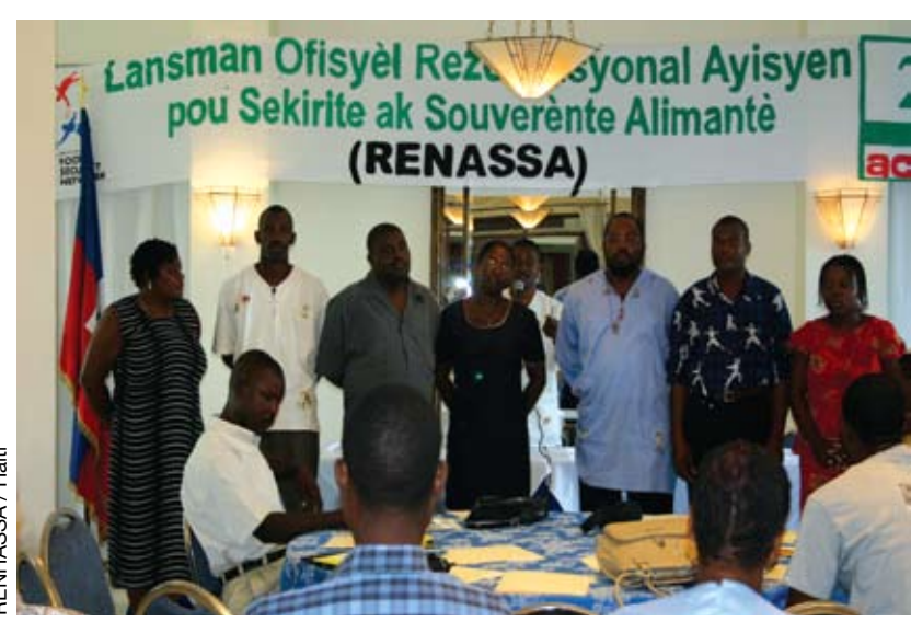
RENHASSA / Haiti

Prior to the conference, ActionAid and the Brazilian Ministry of Agriculture organized a seminar to analyze the proposal for ICARRD's final declaration and to make various recommendations designed to guarantee that women's rights to access and control land were assured in the final declaration. ActionAid International was the only NGO focusing specifically on women's rights to land to take part in the conference: we held a 'Women's Rights To Land' seminar during the Parallel Civil Society Forum. Both the seminars and the case studies contributed to generating a broad alliance towards lobbying on Women's rights to land and natural resources and were crucial to what we consider to be a very good declaration from a women's rights perspective. A delegation of IFSN and ActionAid was present in ICARRD, involving 14 countries: Pakistan, The Gambia, South Africa, Malawi, Uganda, India, Nepal, Mozambique, Ethiopia, Bolivia, Brazil, Nicaragua, Honduras and Senegal. This regional balance was crucial in terms of lobbying the regional representatives on the drafting committee of the ICARRD declaration.