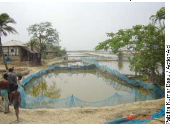
Schrimp farm in Satkhira district