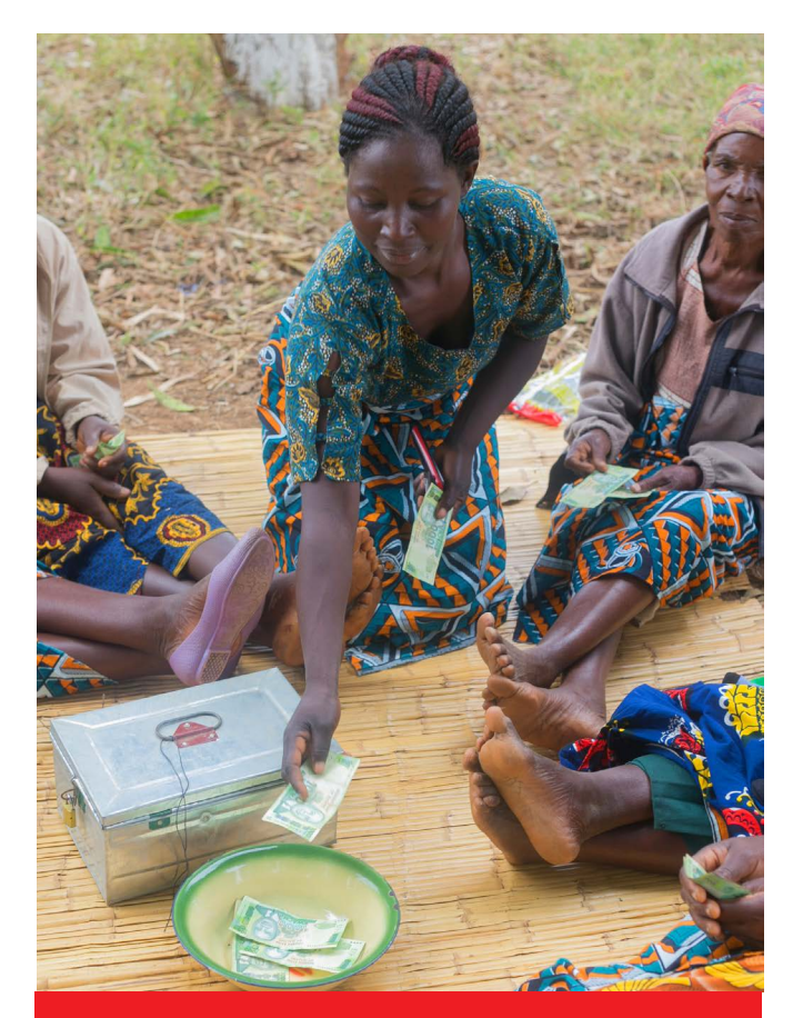
Woman in Ngokwe village, Malawi, is paying her monthly contribution to the local Village Savings and Loans group.

Training on basic principles of Climate Resilient Sustainable Agriculture, in combination with increasing the skills and capacity of women, such as literacy, empowered women to take a stronger role in resilience activities in their community. In Afghanistan, for example, women now have the skills and confidence to suggest alternative agricultural practices and investments to their husbands, in the knowledge that they will be taken seriously.