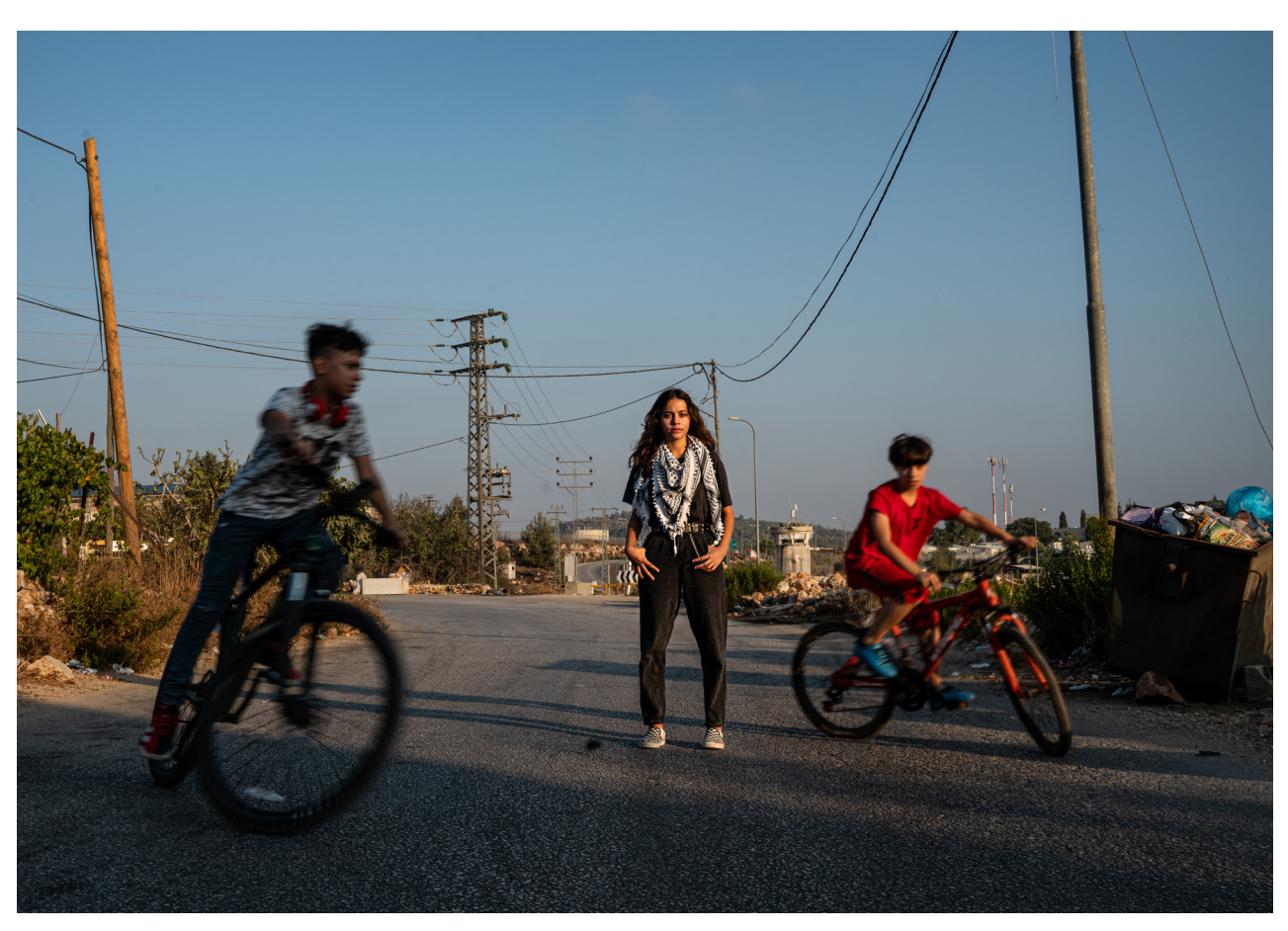
Janna Jihad, Palestinian Journalist and Activist.

In 1922, with the fall of the Ottoman empires, Palestine was placed under British mandate by the League of Nations. All the other territories mandated eventually gained independence, but for Palestine. Instead, the United Kingdom expressed in 1917 support for "the establishment in Palestine of a national home for the Jewish people" resulting in large-scale European immigration of Jews to Palestine.