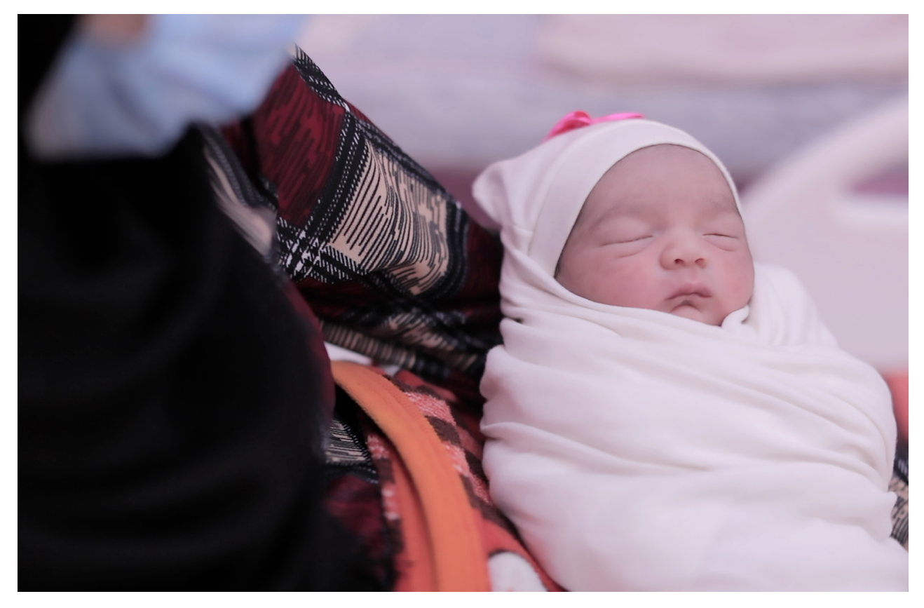
Fear and anxiety after latest attacks leave new mothers in Gaza unable to breastfeed and bond with their babies.