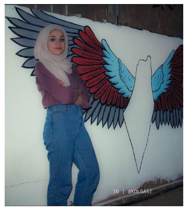
Young Palestinians living in East Jerusalem are harnessing the power of social media and music to tell the world about their fears of forced eviction and what life is like living under Israeli occupation.

Several members of the Palestinian Legislative Council have been placed under administrative detention, which is detention without a charge for potentially indefinite periods, in a concerted campaign since 2006. Unlawful association is a crime that Israel applies to all major Palestinian political parties and several non-governmental and charitable organizations.<sup>82</sup> These members are elected by the Palestinians people and, like Khalida Jarrar, were not accused of a violent crime. Khalida Jarrar is an elected member of the Popular Front for the Liberation of Palestine and she was placed under administrative detention between July 2017 and February 2019 based on "secret information" that is not disclosed. She was re-arrested in 2019 and sentenced to two years imprisonment for assuming a function within an Israeli-prohibited organization. The indictment clarified that she has no ties to any military, organizational or financial work.83 Israel refused to allow Khalida Jarrar from attending the funeral of her daughter Suha Jarrar in July 2021.84