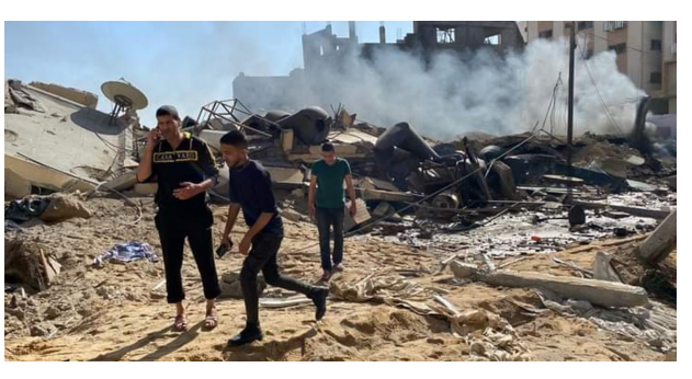
Gaza crisis, May 2021.

Securing a private home space for women and girls is also of exceptional importance in Gaza, due to dominant norms of female modesty and varying degrees of gender segregation. Families who were displaced or lost their homes during the crisis usually express an acute sense of vulnerability towards the bodily safety and security needs of their female family members. In addition, displaced women are more likely than other women to feel unsafe using a bathing or latrine facility. Due to the large house destruction, families are expected to stay at host families resulting in overcrowding which has been reported in previous escalations to increase incidence of sexual and genderbased violence among women and girls.<sup>121</sup>