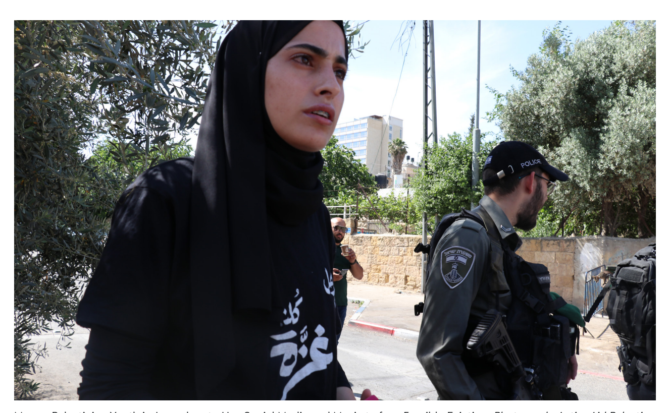
Muna - Palestinian Youth in Jerusalem to Use Social Media and Music to face Forcible Eviction.

Under international humanitarian law, a territory is occupied when it is placed under the authority of a hostile army.<sup>31</sup> The international community, the UN Security Council, and the UN General Assembly, all consider that Israel occupies the West Bank, including East Jerusalem, and the Gaza Strip since 1967. Notably, UN Security Council Resolution 242 from 1967 called for the "Withdrawal of Israel armed forces from territories occupied in the recent conflict".<sup>32</sup>