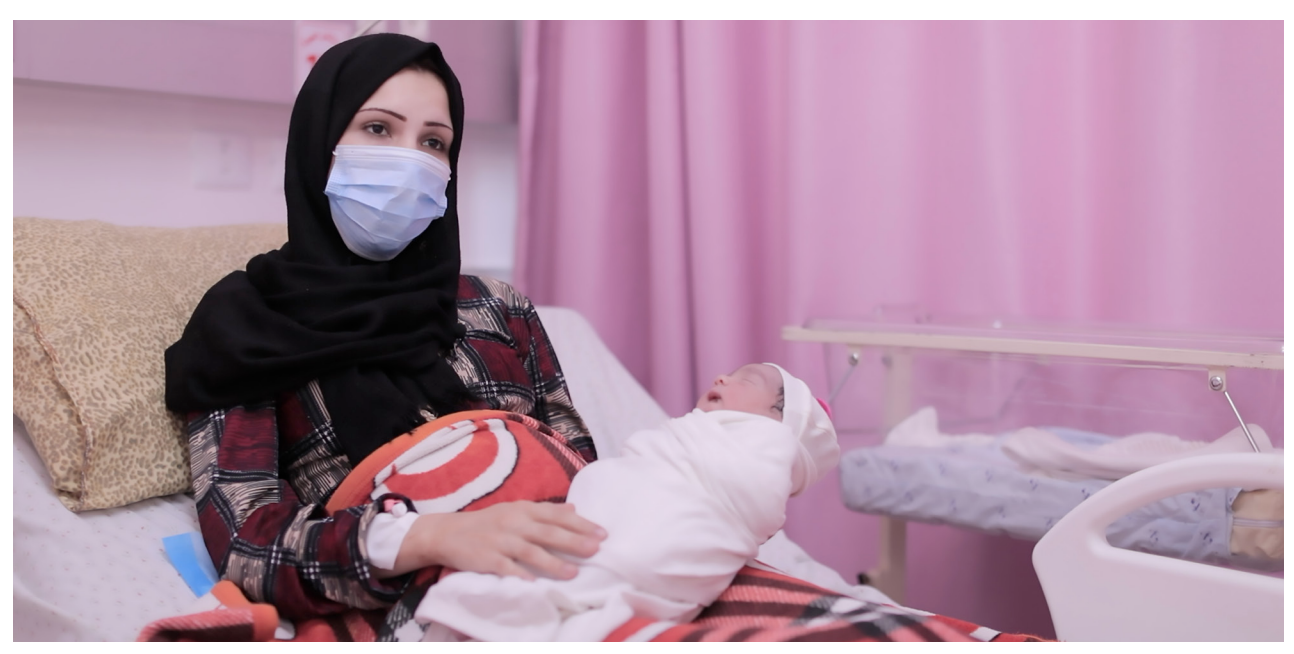
Fear and anxiety after latest attacks leave new mothers in Gaza unable to breastfeed and bond with their babies.

The UN Special Rapporteur on Violence against Women has highlighted that internally displaced women, in particular the Bedouin, are particularly vulnerable to sexual and gender-based violence. For example, in the case of the Bedouin women from the Jahalin tribe, the women have been physically cut from employment prospects through the erection of the Annexation Wall, leaving them few options to support themselves. Women who are excluded from the job market are more likely to marry and women who suffer from domestic violence are less likely to report the abuse if they risk losing their income. 136 The same Special Rapporteur found that women and girls living in refugee camps are at risk of particular forms of violence that result from their confinement to the household.137