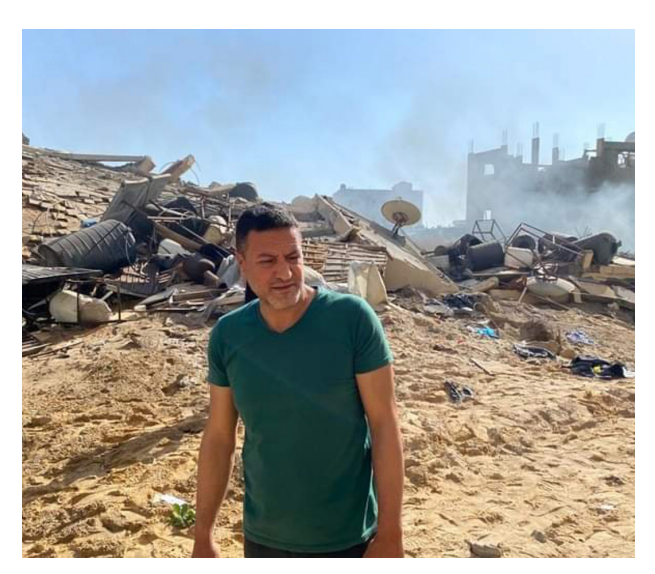
Gaza crisis, May 2021.

Since 2009, the OCHA has recorded the destruction of nearly 8,000 structures, displacing 12,000 Palestinians and affecting almost 130,000 persons in the West Bank. More than 1,400 of those structures have been donorfunded. According to OCHA, the Israeli Civil Administration has issued more than 14,000 demolition orders against Palestinian-owned structures in Area C since the start of the occupation because Israel did not issue building permits for their construction. 128