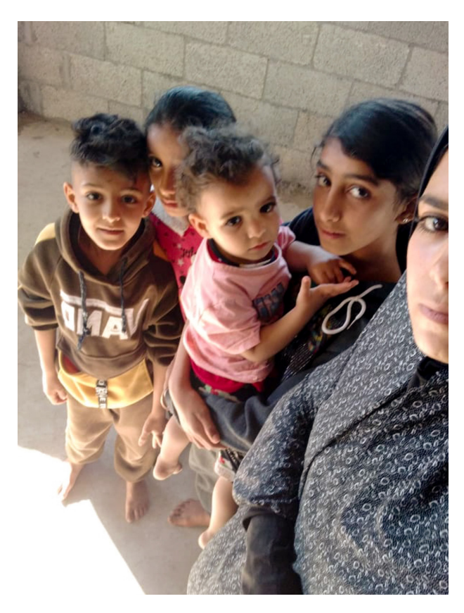
Gaza crisis, May 2021.

Israel's treatment of Palestinian natural resources, for the benefit of its own economy and nationals, obstructs the development of the Palestinian economy. The UNCTAD estimated in 2019 that Israel, in preventing Palestinian development of its oil and natural gas reserves in the West Bank and Gaza Strip, has caused accumulated losses in the billions of dollars for Palestine. 183