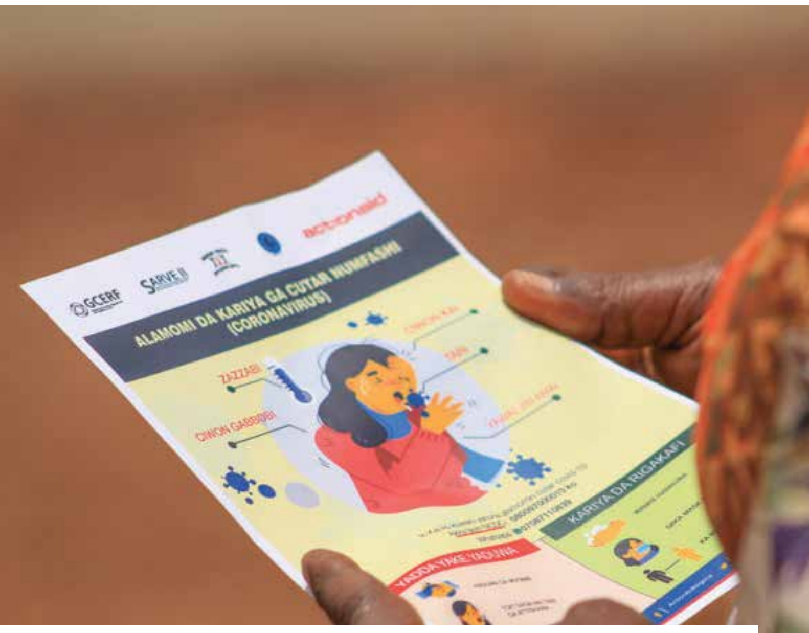
ActionAid Nigeria and partner, Beacon Youth Initiative engage traditional leaders/institutions on COVID-19.