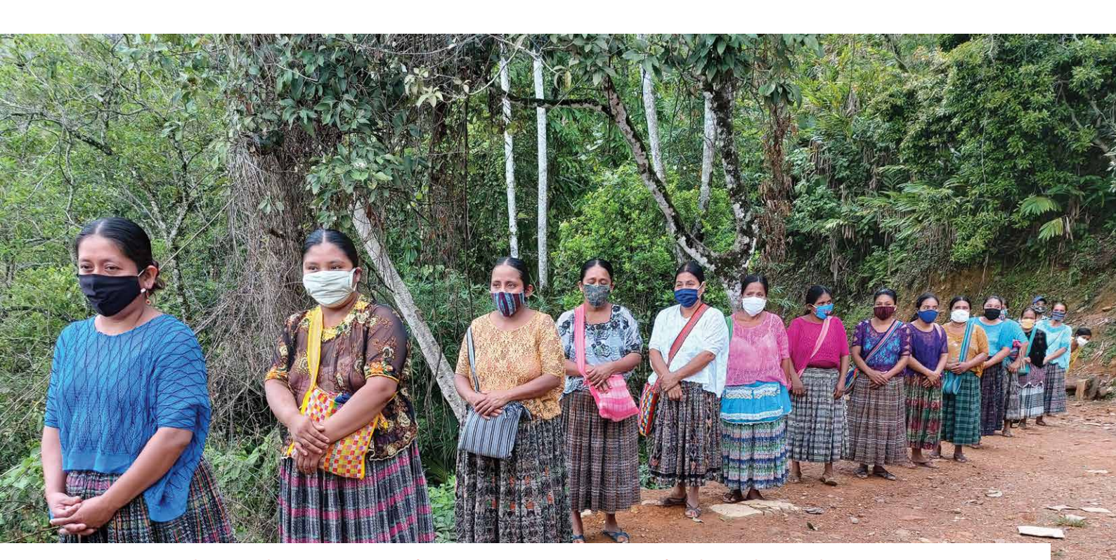
Mothers in the community of San Jose Tinajas receiving food supplies and some hygiene supplies to combat this disease, Guatemala.