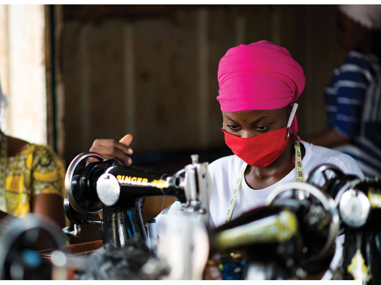
Covid-19 awareness, preparedness and prevention activities, Ghana