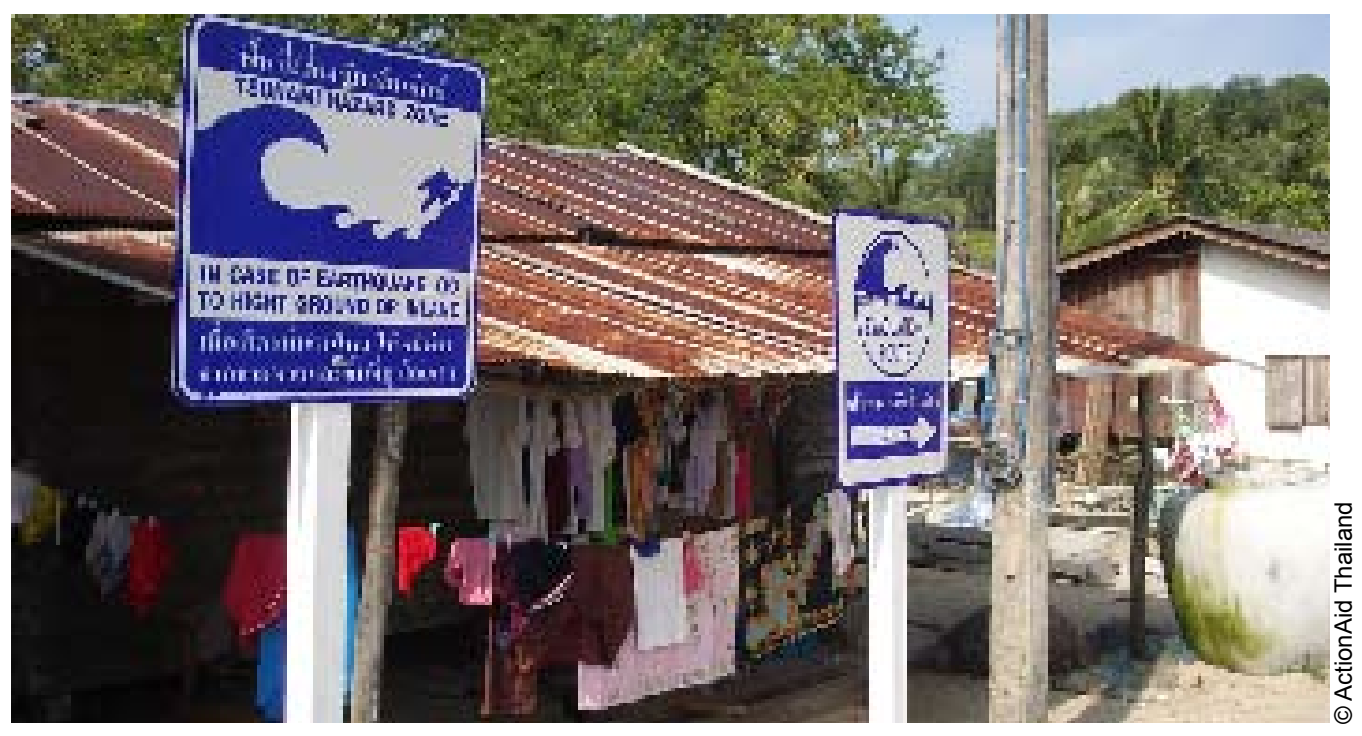
Disaster Risk Reduction: tsunami warning signs were posted along emergency evacuation routes in Thailand.

right to land. People's participation is unequivocally recognised as a critical factor in good governance. For this to be meaningful, particularly in the post-disaster context, people must have easy access to the information and the space/opportunity to be involved in the decision-making processes that are essential to their lives: where they live; the house design; what they need for their livelihoods; and how to be safe from violence and future disasters.