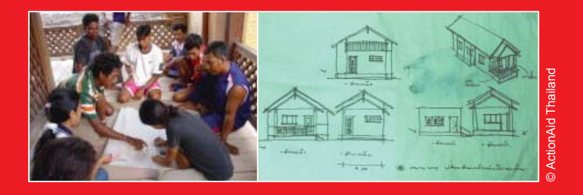
Figure 1: Community-driven housing reconstruction process