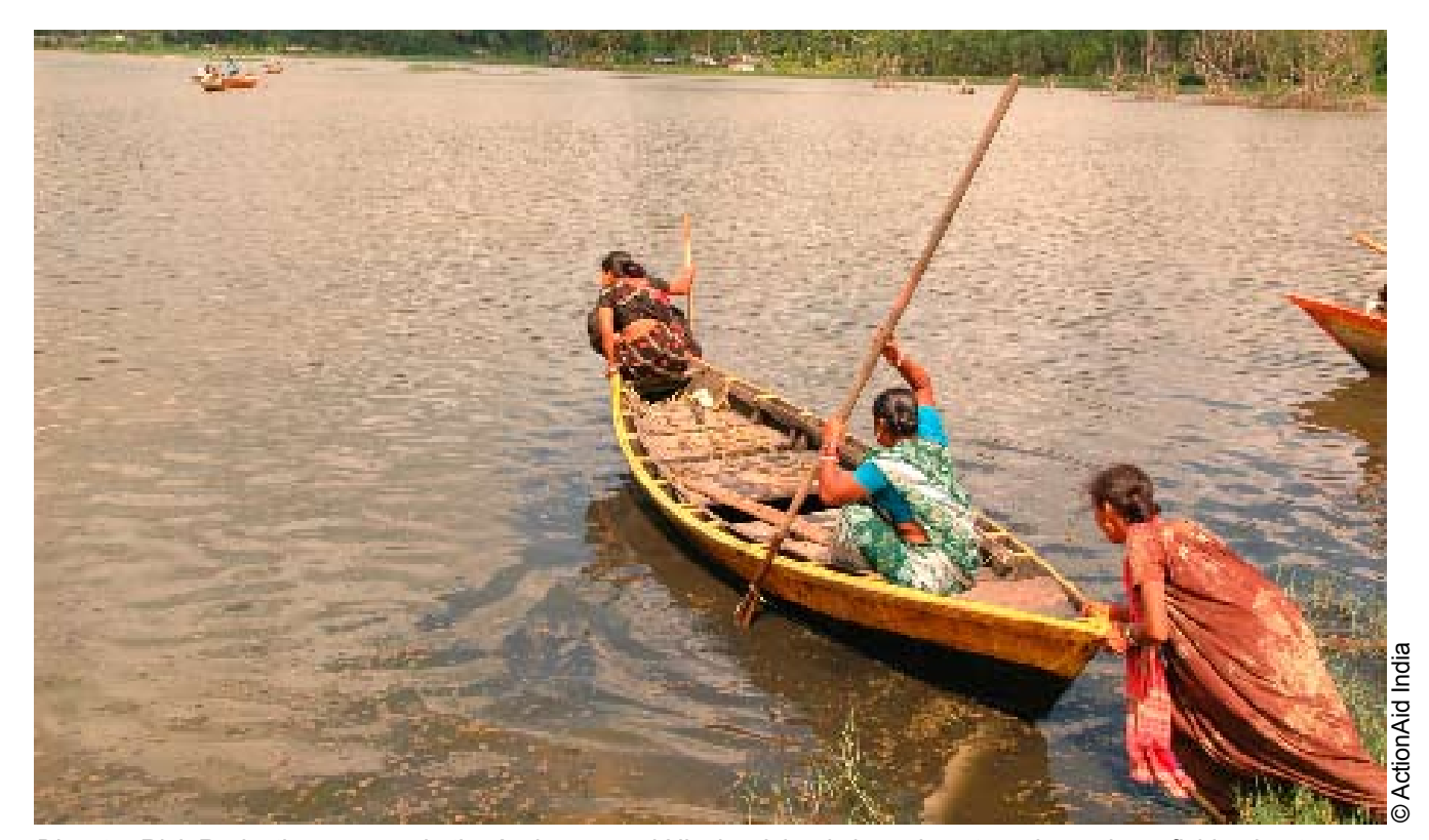
Disaster Risk Reduction: women in the Andaman and Nicobar Islands learn how to swim and row fishing boats.

Participatory Vulnerability Analysis (PVA)<sup>3</sup> was used to develop a community-based and led disaster preparedness mechanism at the village level. Vulnerability in this context was analysed with its inextricable relationship with poverty, and poverty in turn being an outcome as well as a cause of skewed power relationships. The PVA approach facilitates the community's identification of the hazards, their vulnerabilities, the resources available in the village and the formulation and implementation of a disasterpreparedness plan, ultimately building upon existing local capacities and coping mechanisms to build resilience to disasters. In addition to this specific DRR work, disaster risk reduction perspectives were integrated into most project interventions. For example, to reduce the vulnerability of women to hazards such as tsunami and flood, women learnt how to swim and row fishing boats, both of which were earlier considered to be culturally unacceptable for women. The houses constructed were made disaster resilient and people were supported to diversify their livelihood options.