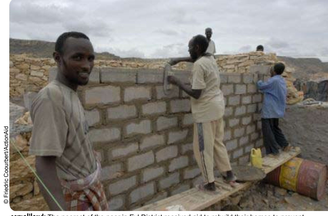
somaliland: The poorest of the poor in Eyl District received aid to rebuild their homes to prevent them sliding deeper into poverty.