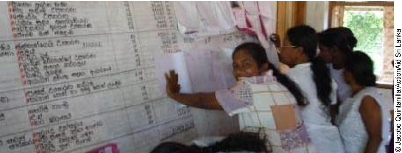
A public hearing in Somaliland (top) and tsunami-affected women in Sri Lanka participate in a community review (bottom).