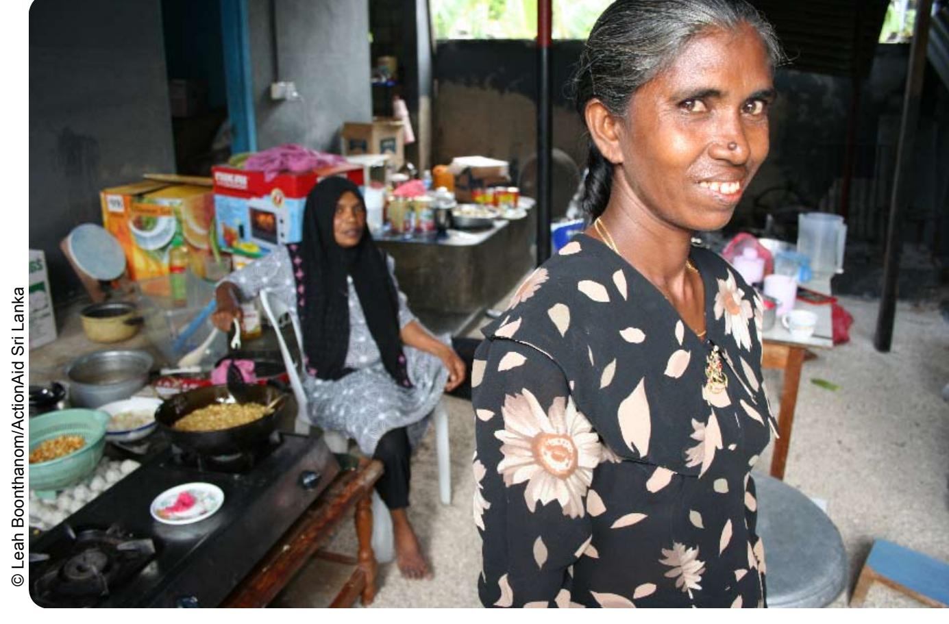
maldives: Affected women in all countries reported consistent, persistent and structural discrimination.