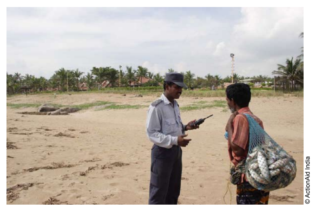
A fisherman is denied access to his traditional homestead coastal land.

At the same time the Government proposed that the Coastal Zone Management (CZM) Notification replace the CRZ Notification, based on the recommendations of the Swaminathan Committee Report. However, the CZM Notification does not provide for the rights and access of coastal communities. For example, livelihood activities such as fishing in CZM I waters and shores have not been mentioned thus compromising the livelihood security of traditional fishers.