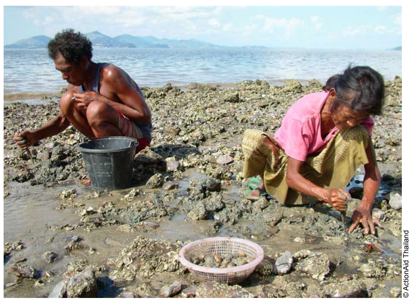
Thailand's Moken 'sea gypsies' and other minority groups were typically excluded in the disaster response.

be given primary consideration when drafting and implementing government housing policy.