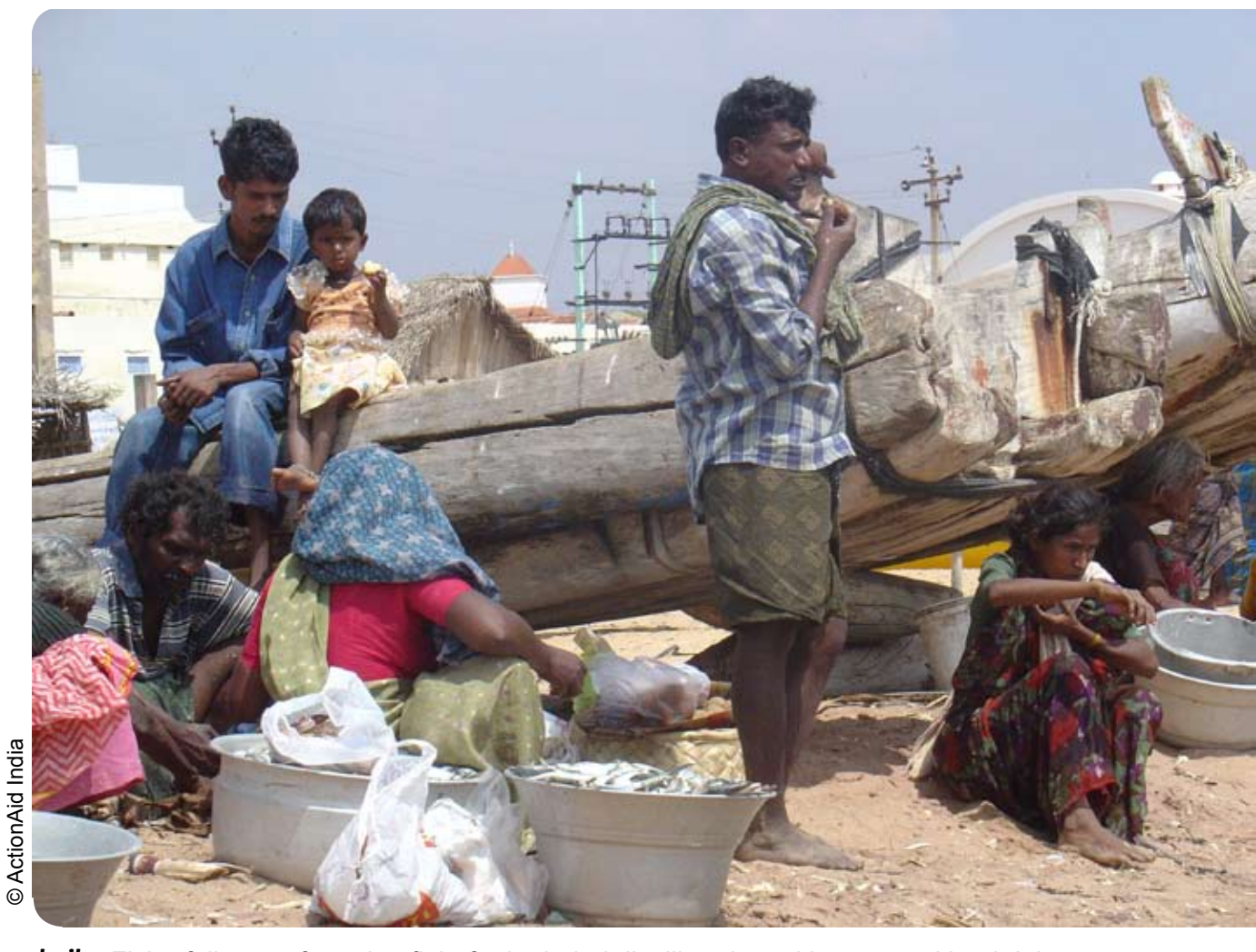
india: Fisherfolk were forced to fight for both their livelihoods and homestead land rights.