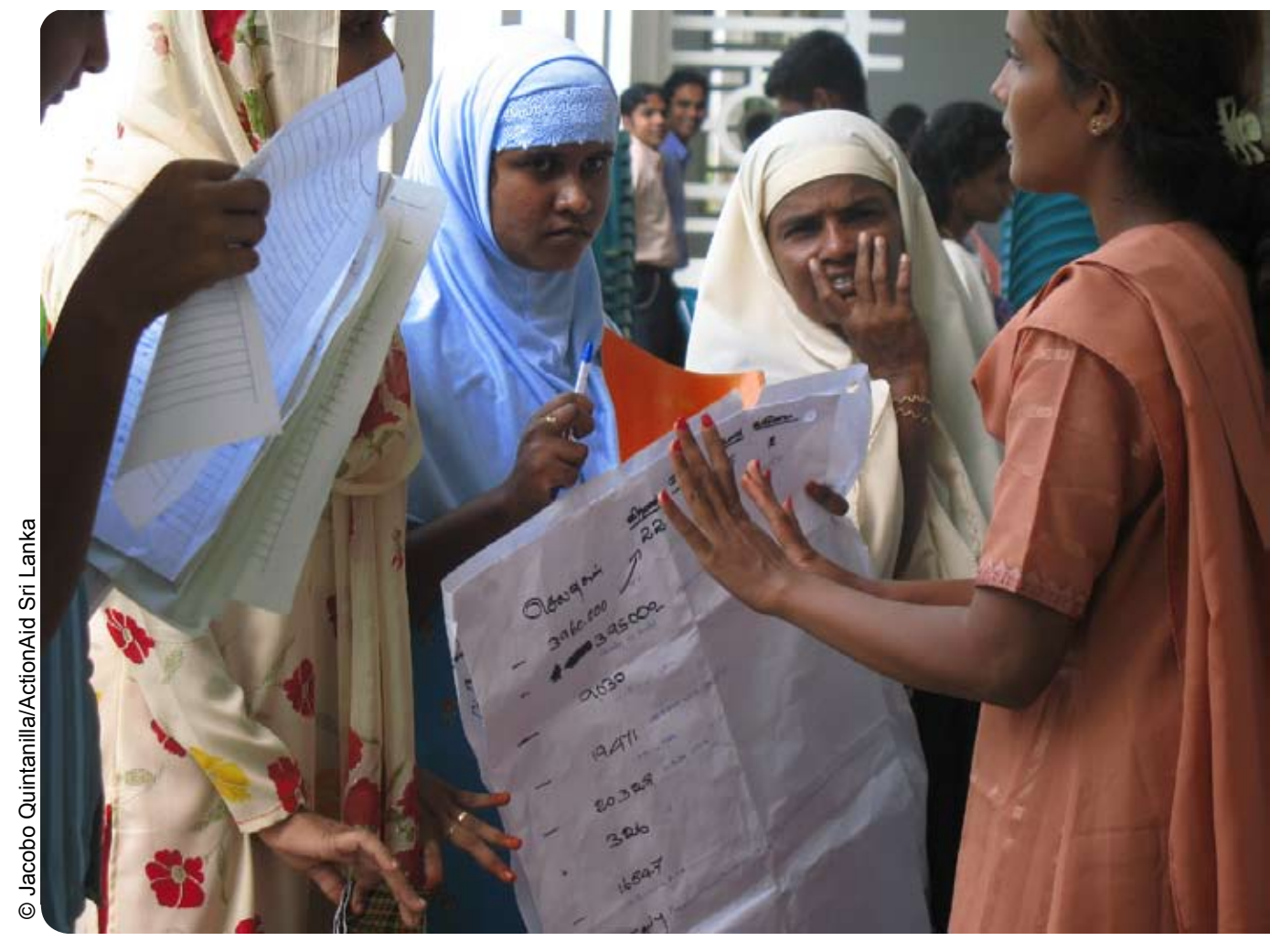
$ri Lanka: Community reviews were held in affected villages to ensure public accountability of programmes.